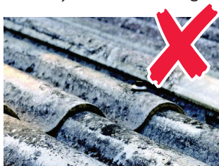
Super six asbestos roof

If your home was built before 1990 it's likely to contain asbestos. If you're not sure, don't risk it—get it tested before you start working on it.