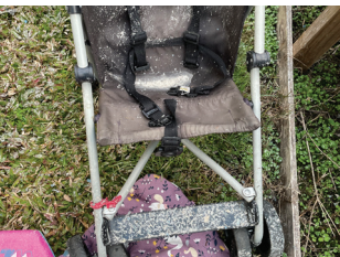
Asbestos debris on pram