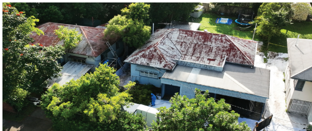
Clean up and disposal of asbestos in a residential home