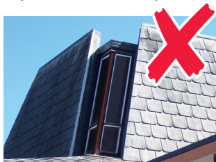
Shingle asbestos roof