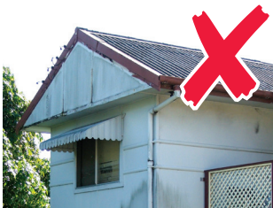
Asbestos wall sheeting