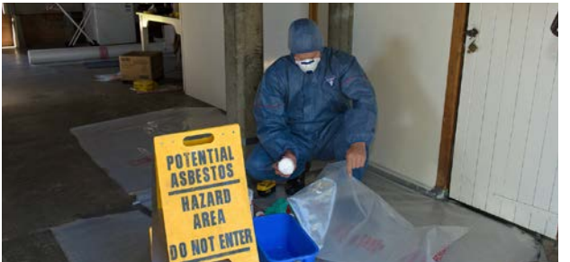
Examples of asbestos dust control measures