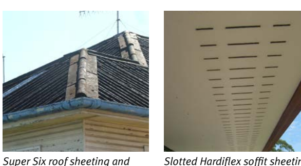
Slotted Hardiflex soffit sheeting