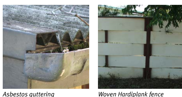
Woven Hardiplank fence