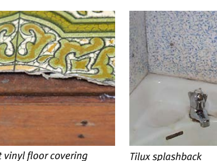
Sheet vinyl floor covering